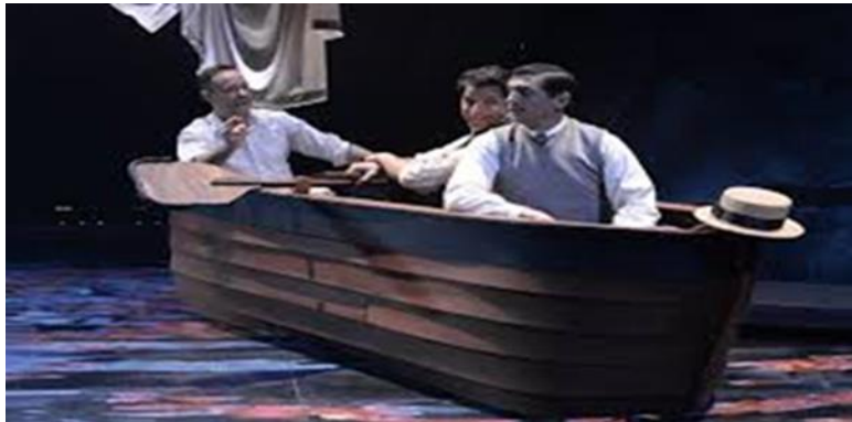
The Invention of Love, AEH and Charon

This course will examine the expressions of queer desire and queer poetics in both the exuberant (Wilde, Byron, Auden) and closeted voices in 19 th C. poetry. Romantics, Pre-Raphaelites and Aesthetes will join us. We will study literature, film narrative, and songs that read and re-read the 19 th C. authors, especially Tom Stoppard's two wonderful plays, Arcadia and The Invention of Love , as well as A.S. Byatt's Possession . We will hopefully join with Auden in laughing at the wit of these writers. As a Junior Seminar in English, we'll also consider the life of the literary scholar as depicted in these works.